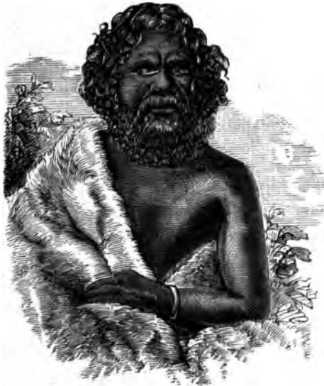
DRESSED FOR A CORROBORY.

while dancing around the fires throw the empty bottles at one another, often cutting themselves very severely. As the dance progresses their gestures and cries become stronger, each one vying with the other in the production of the most horrible yellings and screechings, till all become thoroughly infuriated. The